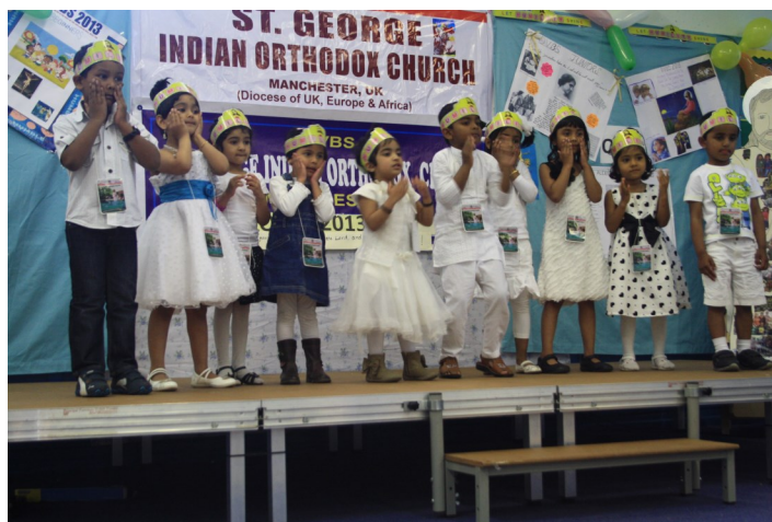
St. George OVBS –Manchester

More photos and reports from various OVBS units will be published in the next issue